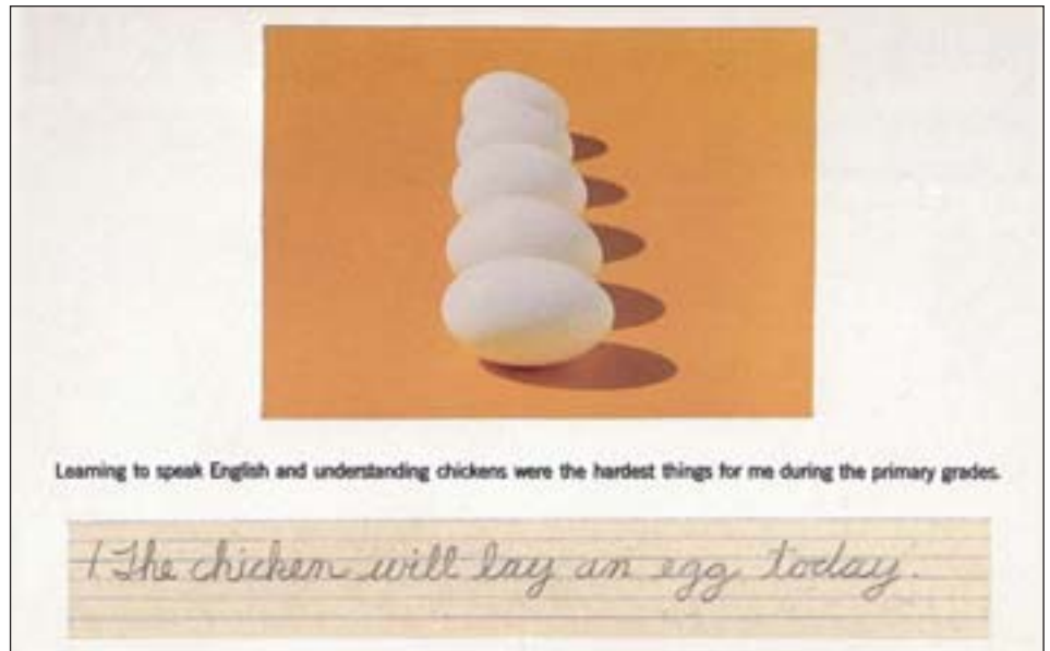
CELIA MUÑOZ, "WHICH CAME FIRST?" ENLIGHTENMENT #4, PAGE 1, 1982

Minority teachers may also serve as needed role models for minorities and dis-