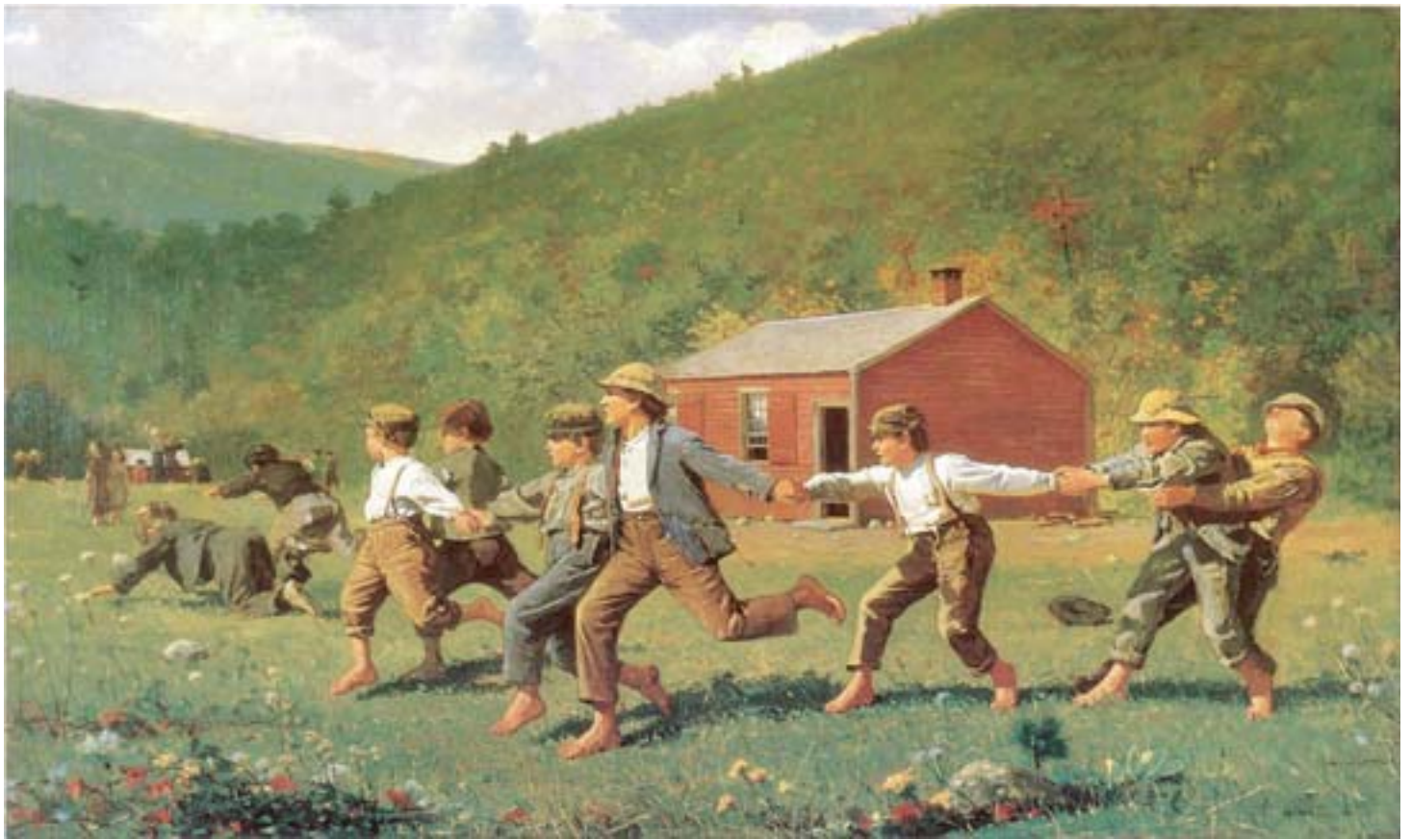
WINSLOW HOMER, SNAP THE WHIP , 1872