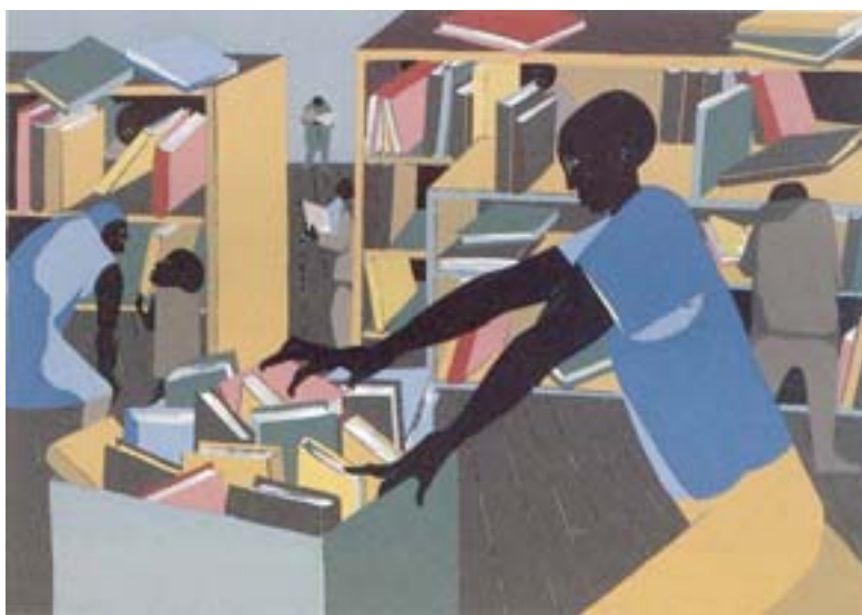
JACOB LAWRENCE. LIBRARY, 1978