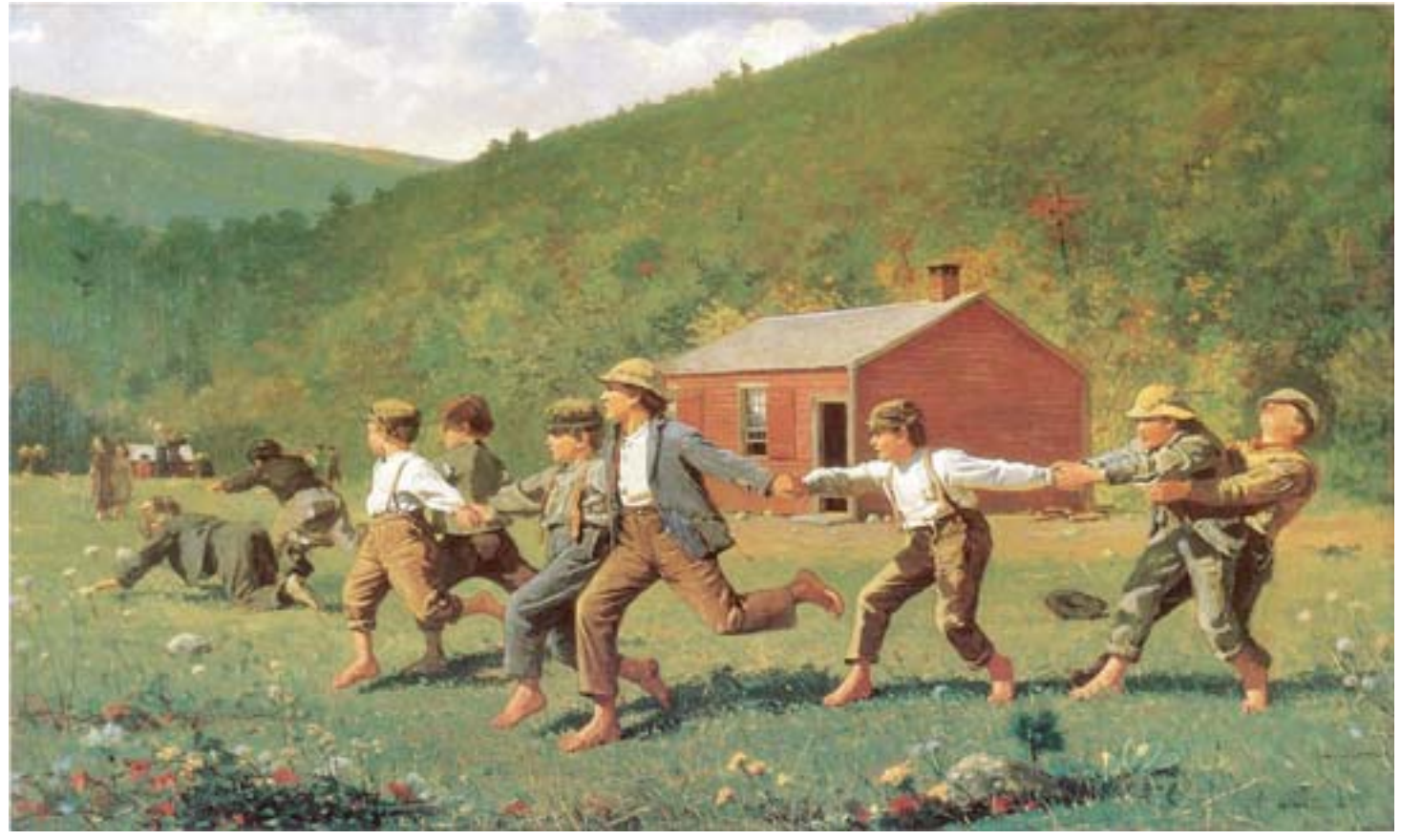
WINSLOW HOMER, SNAP THE WHIP, 1872